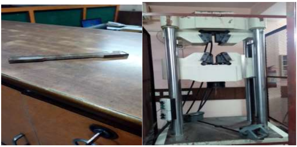
Fig 5.Specimen for tensile test