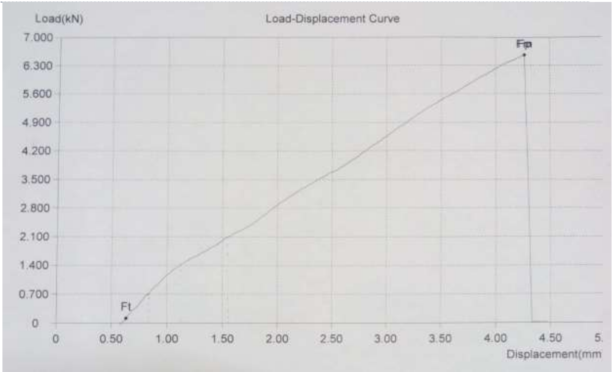
Graph 1. Tensile Test