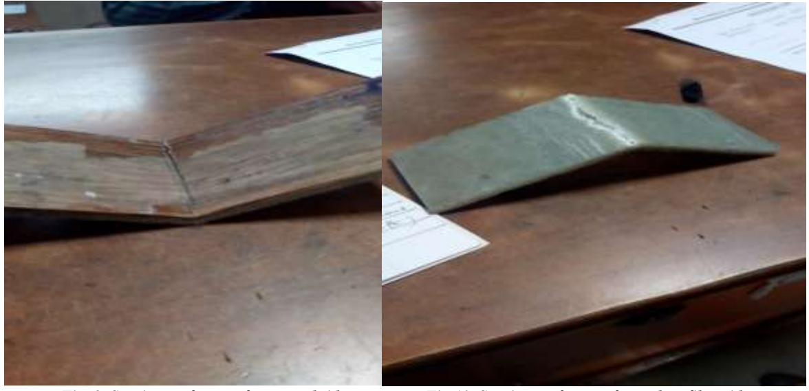
Fig 9. Specimen after test from wood side