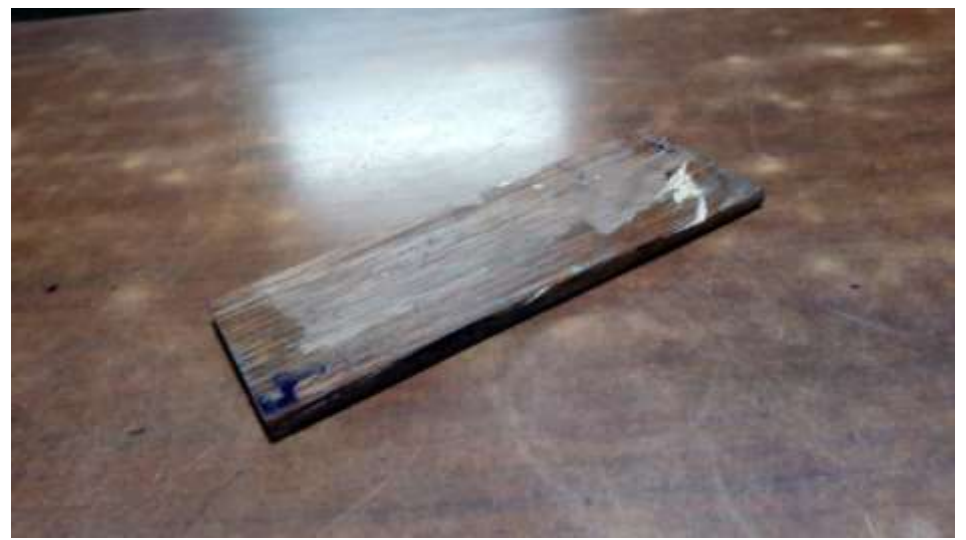
Fig 7. Specimen for compressive test

Specimen with dimension 90 \times 53.5 \times 6.1(L \times W \times T) are used in this test. Load is applied keeping the surface with ply upward and the surface with glass fiber downward. Thus, glass fiber bears the tensile load and plywood is kept to bear the compressive load. Fig 7. Shows the specimen on which the test is performed.