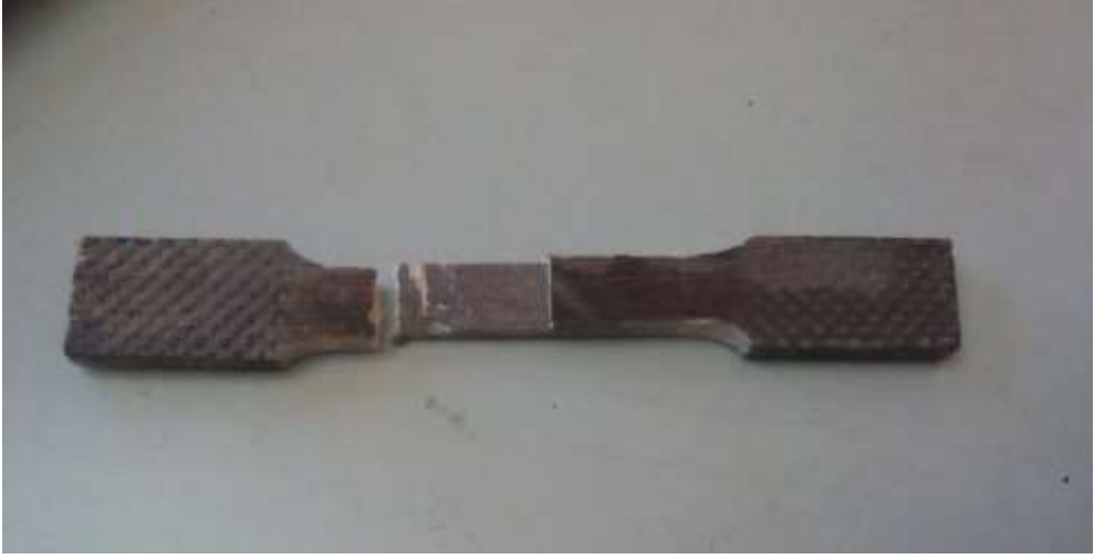
Fig.8 Specimen after the test