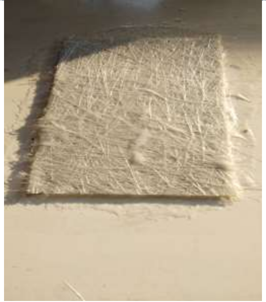
Fig.1 Sheet of chopped glass fiber

ISSN: 2277-9655 Impact Factor: 5.164 CODEN: IJESS7