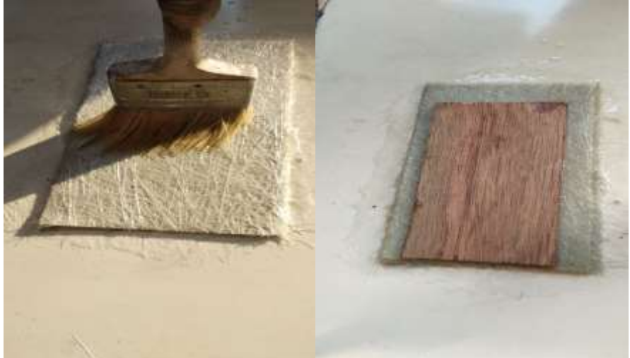
Fig 2. Application of epoxy on chopped Fig.3 Plywood placed on the glass fiber sheet Glass fiber sheet

ISSN: 2277-9655 Impact Factor: 5.164 CODEN: IJESS7